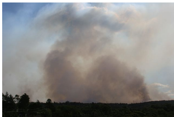
Smoke rises above a burn in the National Park near Linden (5 Apr 08).

Over the past week we've been very fortunate with the weather conditions, which have enabled various land managers to undertake some strategic fuel management burns.